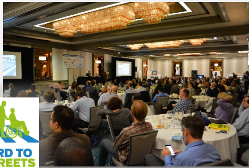
Safe Streets Summit 2016. City of Deerfield Beach, FL.