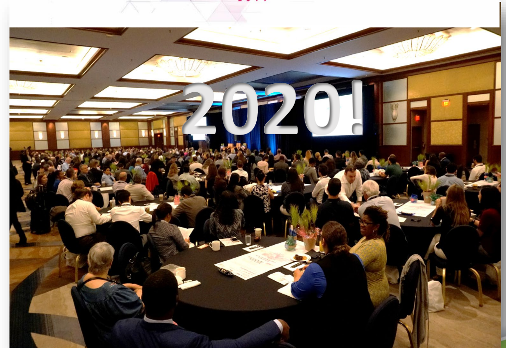
Safe Streets Summit 2019. City of Miami, FL.