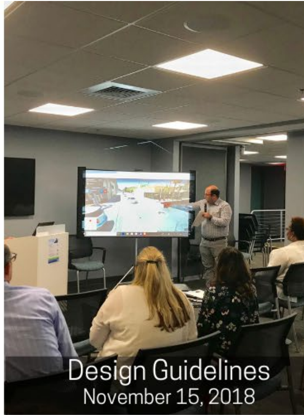
Design Guidelines November 15, 2018