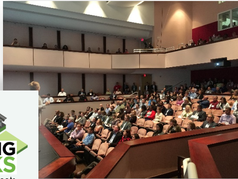
Safe Streets Summit 2017. City of Sunrise, FL.