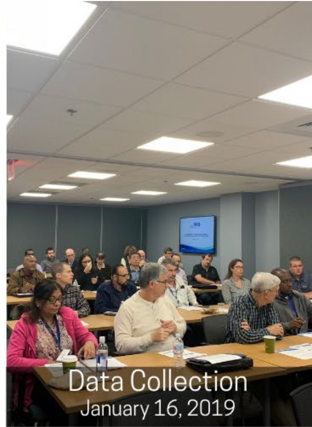
Data Collection January 16, 2019