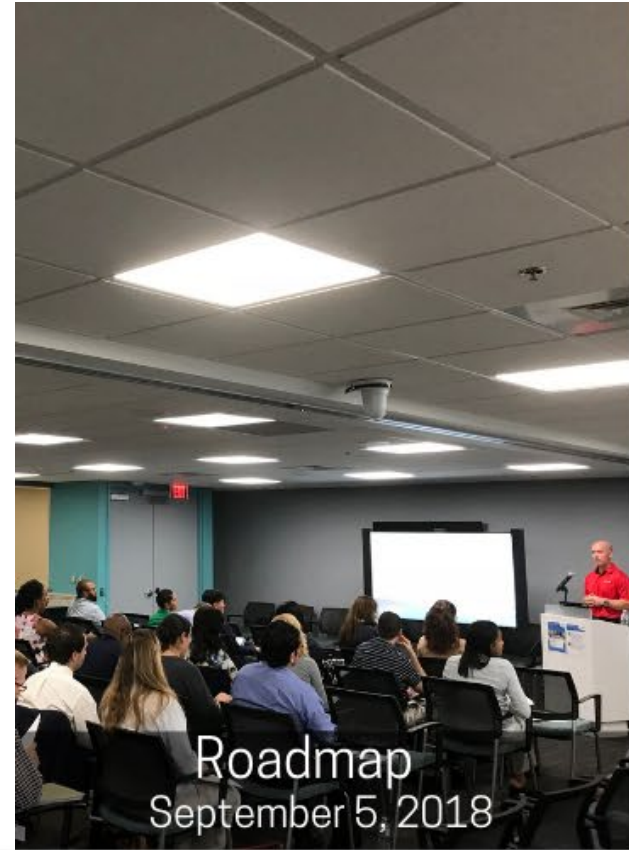
Roadmap September 5, 2018