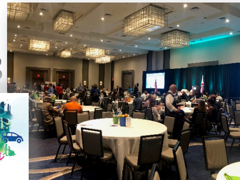
Safe Streets Summit 2018. West Palm Beach, FL.