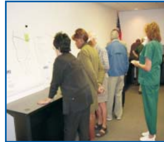
Members of the community view maps at a recent Transit "Bridge" meeting.

You may recall a past edition of Shortcuts included the "WHAT IS THE TRANSIT BRIDGE PROJECT" article. To recap, the Transit "Bridge" is a project that will link transit service between southern Broward and north Miami-Dade Counties on State Road 7 using special buses and improved traffic signalization.