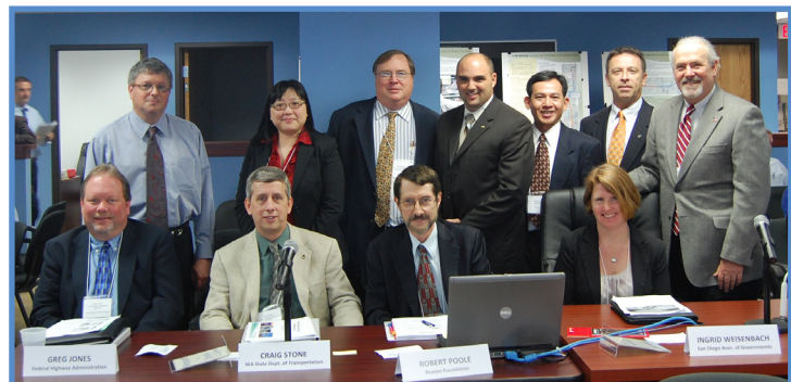
FHWA and the Broward MPO host speakers from around the country to gain a national perspective on Managed Lanes.