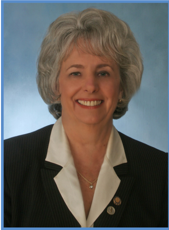
Mayor Rae Carole Armstrong Chair, Broward MPO Mayor, City of Plantation