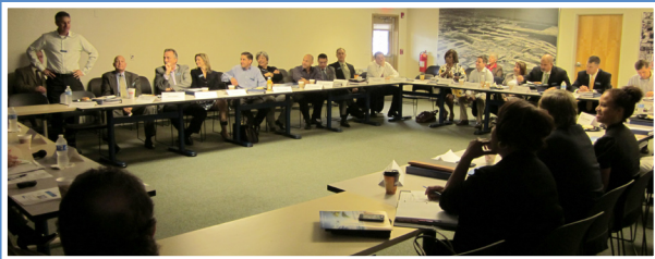
The Leadership Broward Foundation offered a Transportation Session as part of the Senior Executive Orientation (SEO). The panels focused on air, sea and ground transportation.

The Broward MPO continually seeks ways to educate the public about transportation planning opportunities and challenges that face Broward County and the tri-county region. On February 10, 2011, the Broward MPO presented to the Senior Executive Orientation (SEO) of the Leadership Broward Foundation. The SEO is "designed to acquaint senior-level executives with the physical, social, economic and educational structure of our community." Source: http://www.leadershipbroward.org/index.php?sub_menu=Programs&src=gendocs&link=SeniorExecutiveOrientationSEO&category=Programs