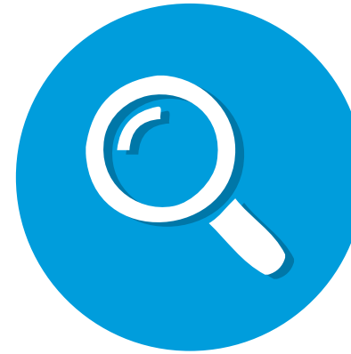
Scope of Work