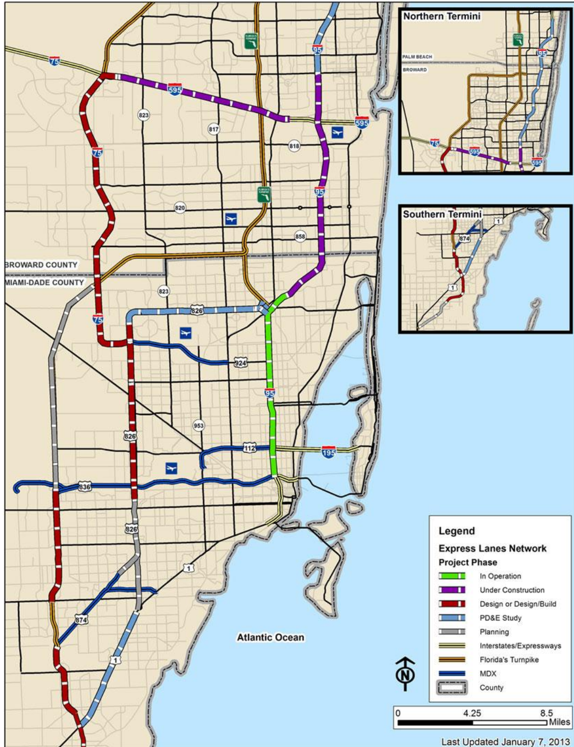
Figure 3-1: Southeast Florida Regional Express Lanes Network

within Broward County and is scheduled to be completed in 2016. This will form a regional express lanes network using dynamic tolling to maintain free flow speeds throughout the day. While I-595 will allow trucks during the pilot phase, the other facilities will not allow truck traffic to use the express lanes. Figure 3-1 provides an overview of the regional express lanes network within Southeast Florida.